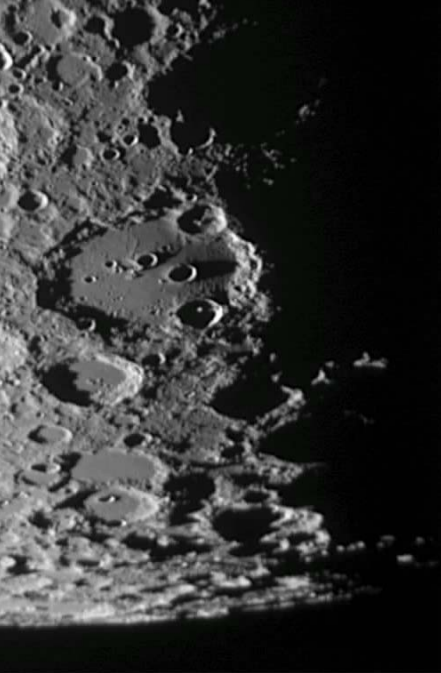
Clavius crater, near the South Pole, site of the base in the movie 2001