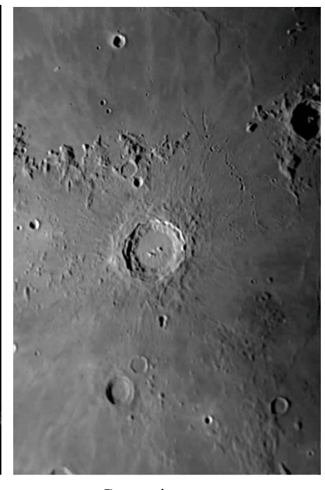
Copernicus crater, "Monarch of the Moon," 60 miles wide