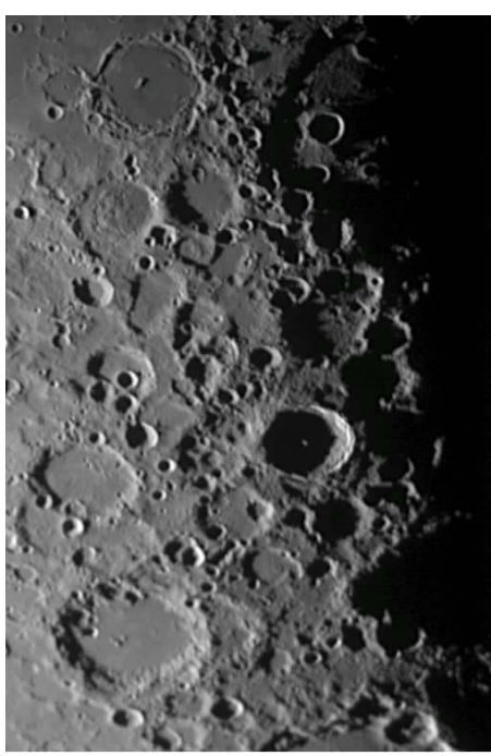
The Southern Highlands, including the crater Tycho