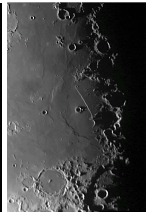
The Straight Wall, a scarp (or cliff) in sunlight