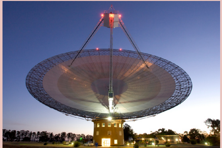
Would you like to use one of these as part of your job?

The old mantra "work smarter, not harder" is very relevant here, especially as data volumes continue to grow at an exponential rate. Two good articles on what it's like to be a PhD student and how to obtain a PhD are " How to be a Good Graduate Student " and " So Long, and Thanks for the PhD! ".