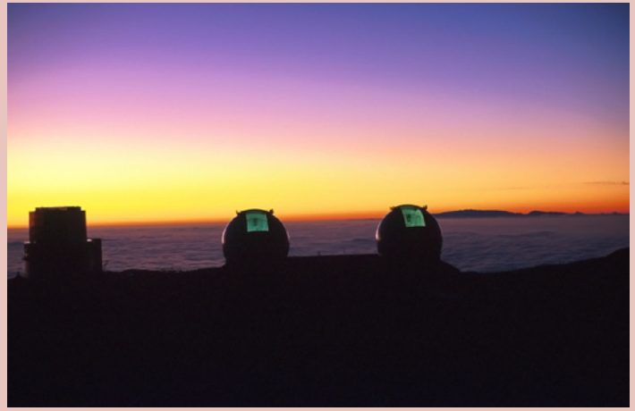
How would you like to work here?

Attributes of a good PhD student include a passion for research, a high level of motivation, well organized, and good verbal and written skills. As a student you will probably be working more than 40 hours a week (think apprentice), so it's important to work efficiently.