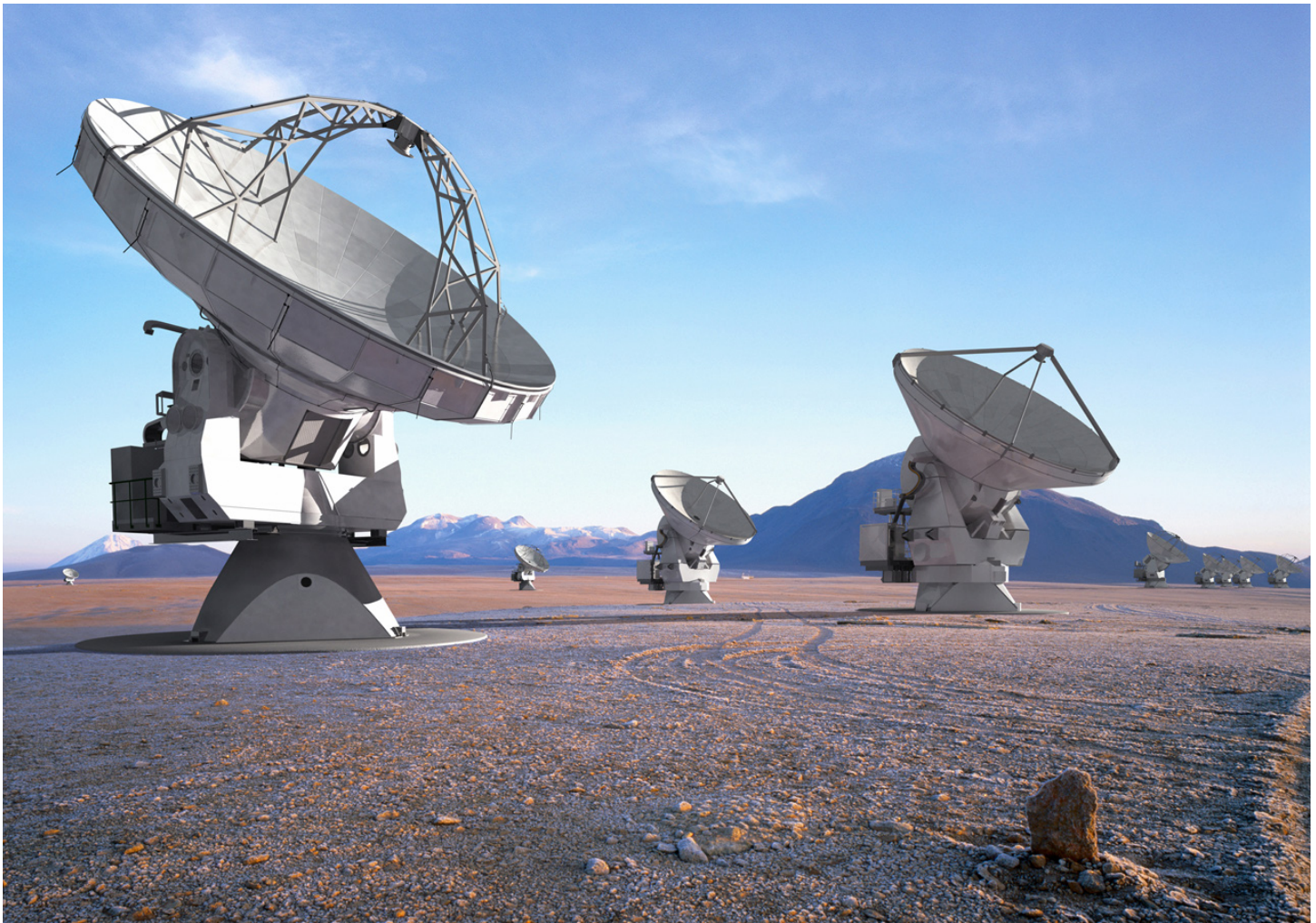
European Southern Observatory

There are a number of new major observatories being planned or currently under construction, including the Atacama Large Millimeter/submillimeter Array (ALMA) in the Atacama Desert of northern Chile. While astronomy isn't a growth industry, there are still plenty of opportunities for eager researchers.