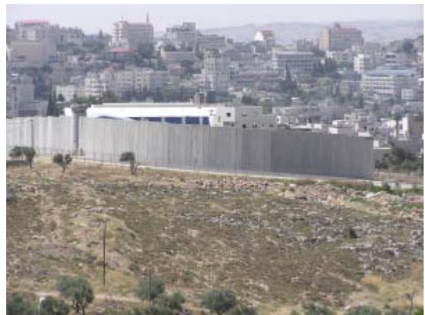
The controversial large and more comprehensive wall separating Palestinian from Israeli parts of Jerusalem.

A drop in suicide attacks has also resulted from limiting employment related travel by Palestinians to Israel. The daily entry of thousands of Palestinians increased the risk of suicide attacks, and many of the former commuting Palestinian workers in Israel have, as a result, been replaced by imported workers from other non-middle Eastern countries. This resulted in greater security for Israel, but in an economic disaster for Palestinians in the West Bank and the Gaza Strip.