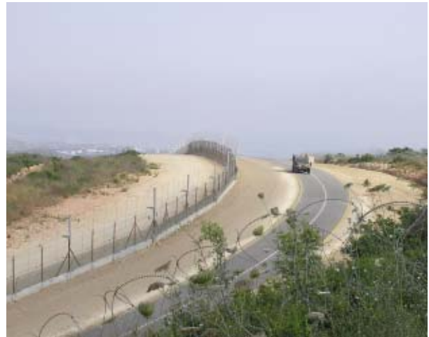
Israeli Border Security patrolling the fence between Israel and the West Bank

The erection of walls and increased security barriers has resulted in fewer incursions by Palestinian terrorists and also in a reduced number of suicide attacks. While the wall does not extend to the entire border between Israel and Palestinian areas, barbed wire fences and continual security patrols along the fence line have been helpful in protecting Persons on the Israeli side.