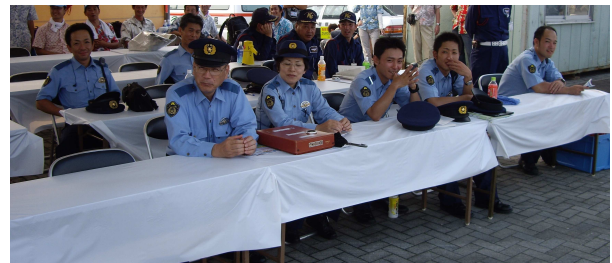
Japanese police officers at a summer festival event in Miyazaki, Japan in July 07.

Japanese media recently focused on the tragedy of Japanese police officers committing suicide. They typically shoot themselves in the break room of their police post (Koban) or police station