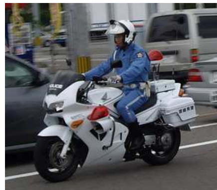
Miyazaki Motorcycle Officer

Japan has 288,451 police officers assigned to 7196 Chuzaishos (one officer living with family in combination police post and home residence), 6262 Kobans (staffed by fewer than 20 officers), and 1218 police stations typically staffed by hundreds of officers. This number does not include the main (47) prefectural headquarters. About 4.1% of all police officers are female and 17, 307 officers or 6% of the total force, have the rank of Captain or above. Of those, 96 or fewer than 1% are female.