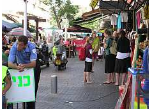
Entrances to shopping malls and even individual shops and restaurants were similarly secured:

Heavy security measures throughout the country were common place and may be a harbinger of what the future may bring us here in the United States. Shopping streets were typically cordoned off with armed security controlling access at both ends.