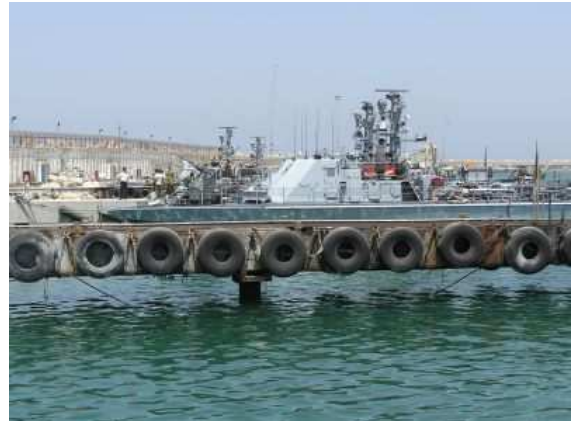
Israeli Patrol Boat

the Israeli Navy uses an extraordinary level of restraint in the use of armed responses and often risks the lives of Israeli personnel in determining the intentions of a vessel approaching the Israeli coastline.