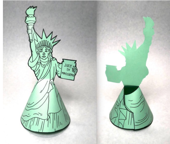
Stand-up statue (easy)