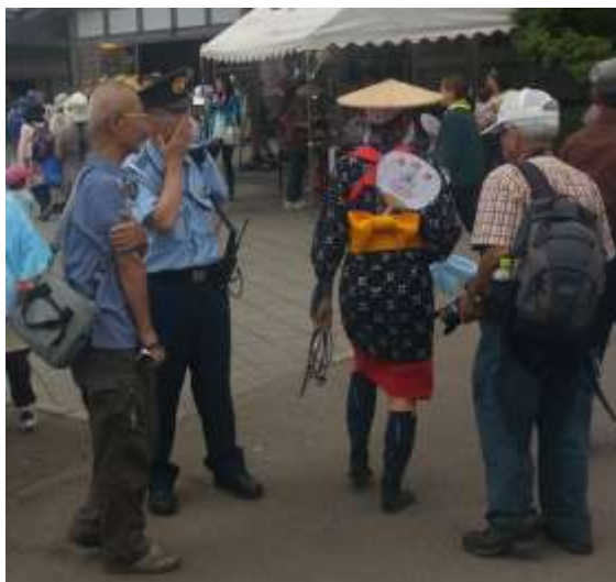
Police officer at a Festival in Japan