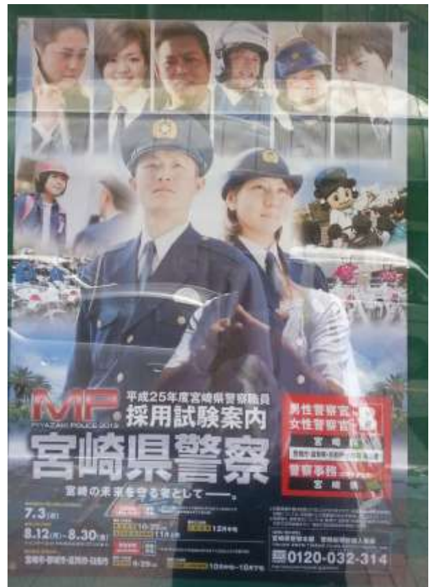
Police Recruiting Poster in Miyazaki, Japan