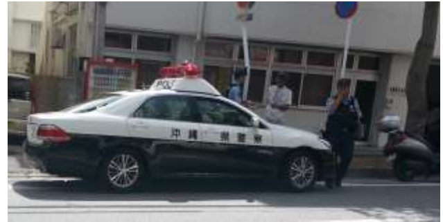
Police Traffic Stop in Naha, Okinawa