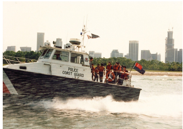
Singapore Police Boat-with police explorers