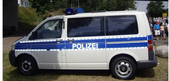
German Federal Police-Bundespolizei