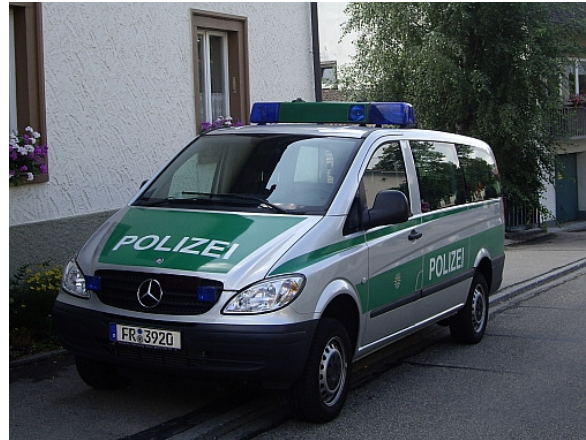
Baden-Wuerttemberg State Police (Germany)