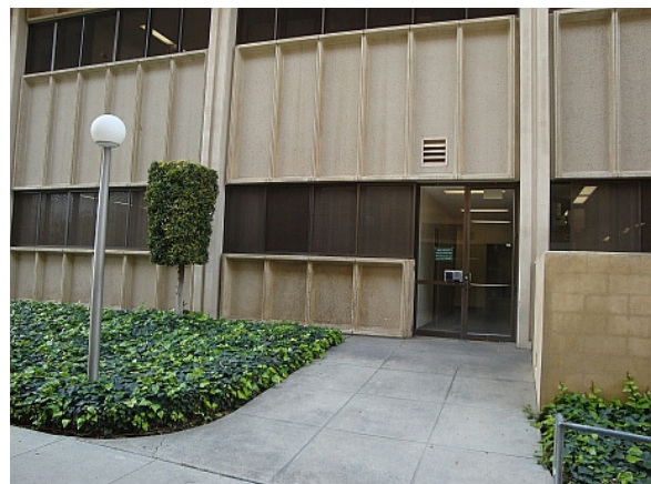
Side entrance for access to training room