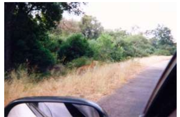
Female leopard waiting to see what I was up to.