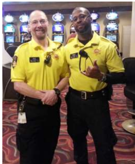
Huh? Is that a gang sign?

The annual meeting was held at Harrah's Hotel and Casino, in the most lively area of the strip, and also only a short distance away from the area where four days later an Oakland rap artist was shot to death during a dispute, followed by a major car crash with several deaths and serious injuries. News reports indicated that two security officers in yellow shirts from a nearby Casino assisted the injured. Harrah's security staff wears such yellow shirts and below are two Harrah security officers.