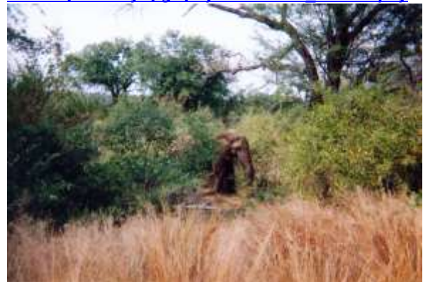
Elephant in Kruger National Park. Photo taken during drive through the park. The elephant appeared very stressed.

http://www.sanparks.org/parks/kruger/conservation/scientific/gis/CyberTracker_Article.pdf