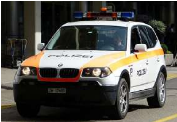
Police car at international airport in Zürich, Switzerland