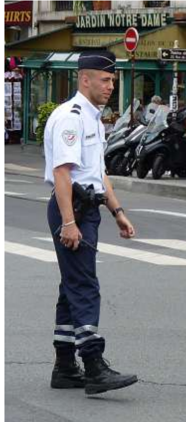
Police Officer in Paris