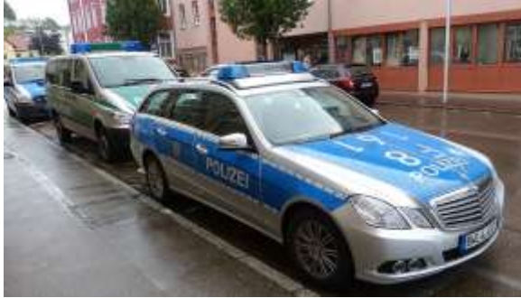
Police patrol car and police van photographed in Waldshut, Germany.