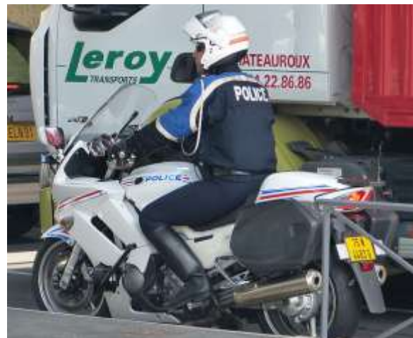
Motorcycle policeman in Paris