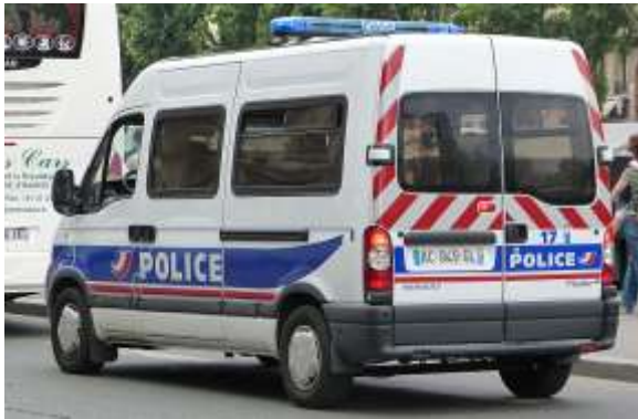
Police van in Paris