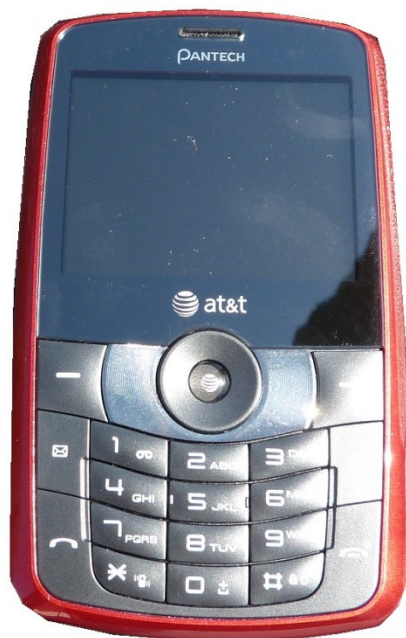
PANTECH REVEAL C790

If you are travelling to Europe, Asia , or anywhere in the world, the Pantech Reveal C790 will work with just about any cell phone system, including Japan and Korea.