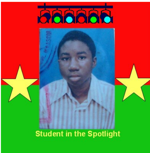
Student in the Spotlight